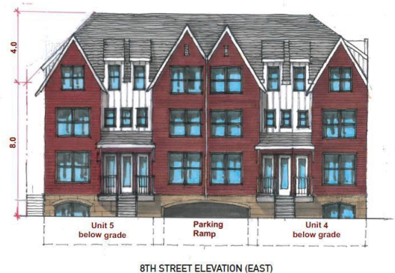
8TH STREET ELEVATION (EAST)