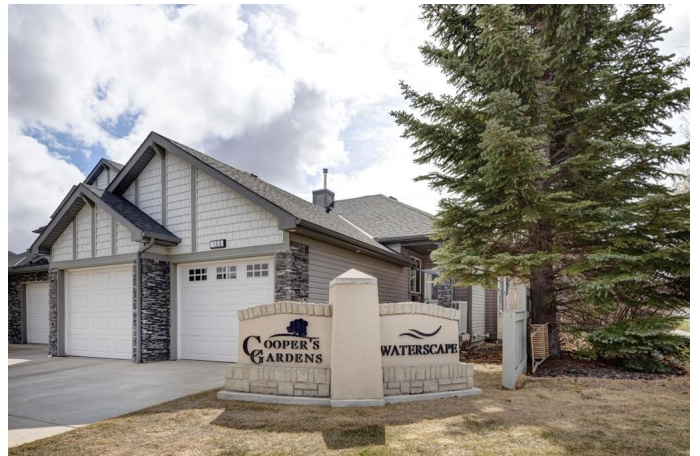
160-100 Coopers Common SW, Airdrie, AB

Open House Sunday, April 27th, 2-4pm. Step into the vibrant heart of Coopers Crossing and claim this rare end-unit bungalow villa, where modern elegance meets unbeatable location. Backing onto the community's scenic pathway system, this home boasts a sun-drenched south-facing deck and yard—perfect for savouring morning coffee or evening sunsets. Inside, meticulous care and recent upgrades elevate every moment. Refaced cabinet doors and drawers gleam in the kitchen, where a sleek moveable island invites culinary creativity. Hardwood flooring has been extended to flow seamlessly from the main living areas into the kitchen and two bedrooms, creating a cohesive, polished look. The main floor is a masterclass in functionality, with the kitchen leading to a spacious dining room, while the living room beckons with a cozy gas fireplace and patio doors that frame the deck's inviting views. A practical mudroom/laundry area connects to the double attached garage, ensuring convenience. Retreat to the primary bedroom, complete with a walk-in closet and a 3-piece ensuite, or host guests in the second bedroom with easy access to another full bathroom. Downstairs, possibilities abound. A spacious recreation room, bathed in natural light from two large windows, sets the stage for movie nights or game days. A third bedroom and full bathroom offer flexibility for guests or family, while an unfinished hobby space or workout room awaits your personal touch. Enjoy year-round