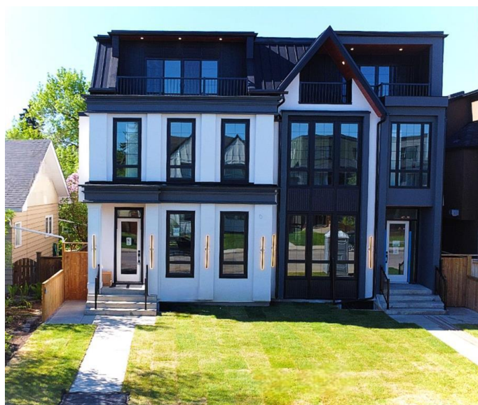
2311 23 Ave SW, Calgary, AB