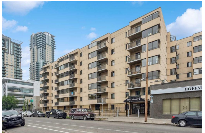
214 111 14 AVE SE - 06.12.2025 Main - 823.17 sq.ft / 76.47 m 2 RMS Area - 823.17 sq.ft / 76.47 m 2